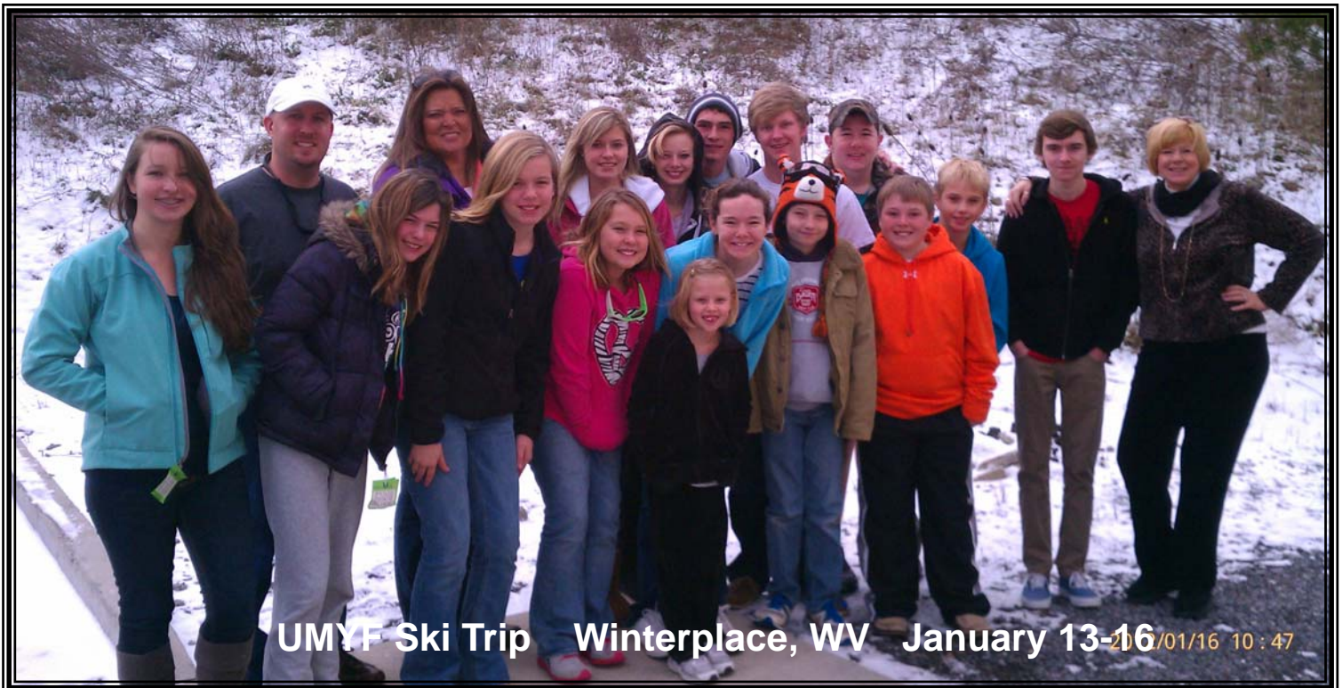
UMYF Ski Trip Winterplace, WV January 13-16 2016/01/16 10:47

We will also be collecting money for CAP in a soup pot after each worship service..